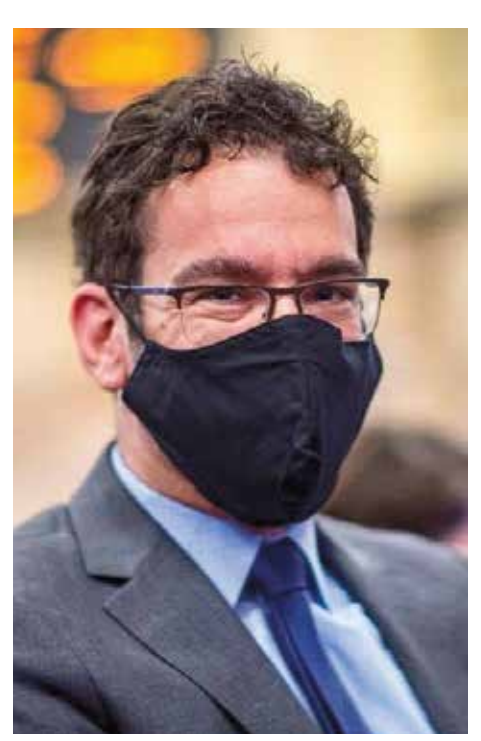
Wearing a mask on the House floor is a sign of respect for the health, safety and well-being of my colleagues.

always easy, my staff and I delivered the same services we would deliver in-person, working 80 hours a week during the worst of the pandemic to assist people. My office is available to serve you, but we do need to take steps My mask